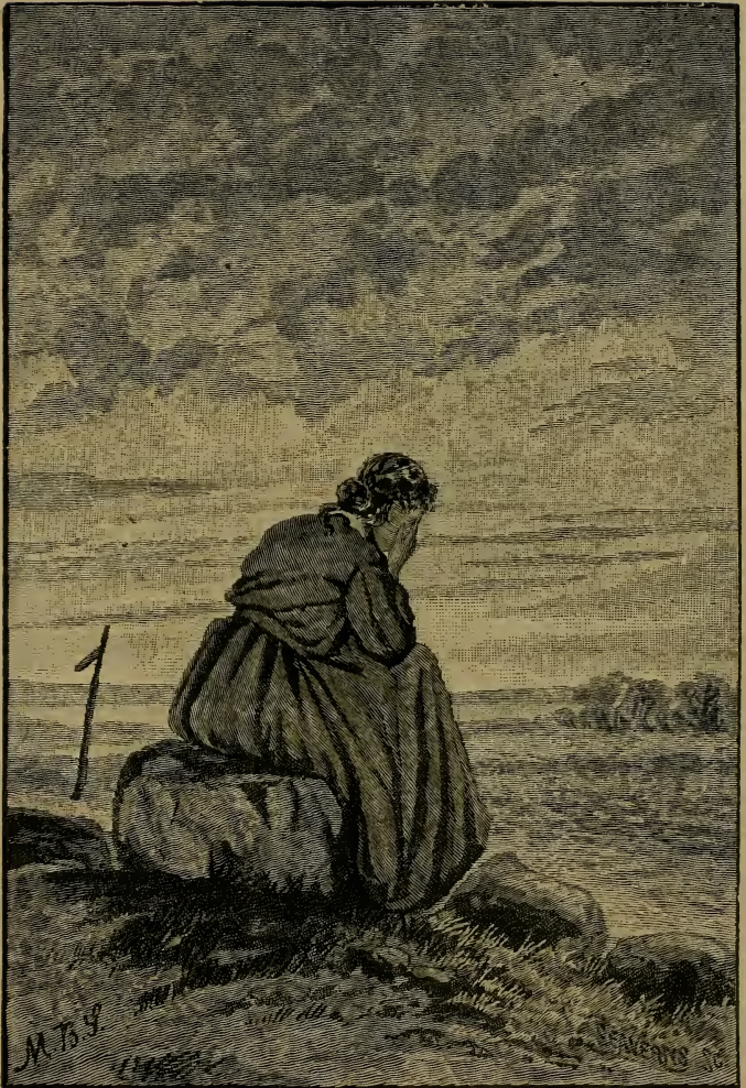
“And there I sate, one evening by the road, I, Marian Erle.” — Page 239.